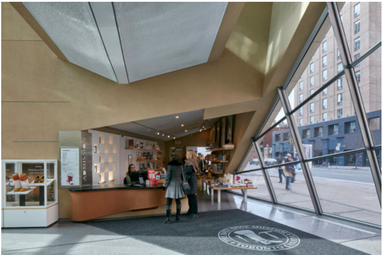
The lobby and gift shop of the Bata Shoe Museum.

Once you arrive, you will enter the building and arrive inside the main lobby. The gift shop will be to your right. In front of you will be the Welcome table.